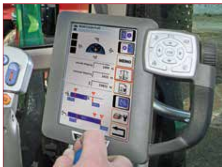
The settings for the CargoProfi are adjusted easily and intuitively with the Varioterminal.