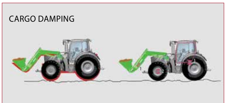
Front loader with damping system:

Gas pressure reservoirs act as shock absorbers and prevent vibrations from being transmitted to the tractor body. The integral damping system (1), together with front axle suspension (2) and cab suspension (3), ensures superior ride comfort (optional).